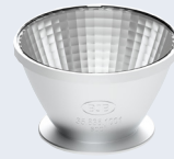
35.835. with cover plate