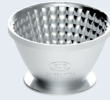
35.835.1004.56 Wide Flood