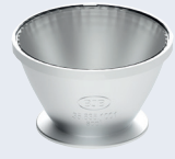
35.835. with diffusor plate

Effect on the beam angle and the efficiency of the reflector when combined with a cover plate or diffusor plate. (measured with COB Citizen CLU02J and connector 47.360.1020.50 ). The values are for reference only.